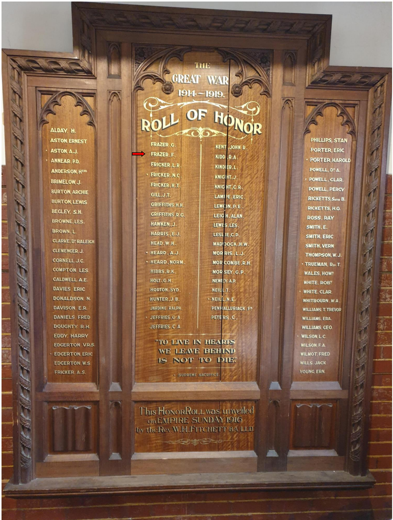
Caulfield RSL Honour Board

F. Frazer is remembered on the Caulfield RSL Honour Board, located in Caulfield RSL, 4 St George's Road, Elsternwick, Victoria.